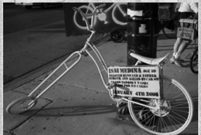
Isai Medina ghost bike (removed)

As of 2013, there are 21 documented ghost bike sites in Chicago: 12 existing memorials, 8 bikes that have been removed, and an art installation called 1,000 Ghost Bikes (a “meta memorial”) at Ravenswood & Montrose, near Lillstreet Art Center. The Chicago ghost bike project is an independent effort; volunteers create ghost bikes for accident victims with the goal of making the project unnecessary.